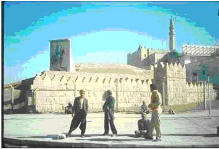
The Shrine of Jonah at Nineveh

The Connection of the Haftorah to Yom Kippur: Similar to the morning service, we read the book of Jonah in the afternoon service of Yom Kippur since it applies to the day. The book of Jonah shows us that not only can no one run from Hashem, but it also shows that if you truly repent, even the harshest punishment can be reversed.