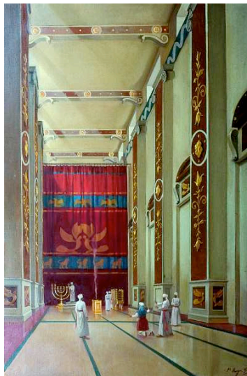
The Sanctuary in the Temple

Famous Phrases: Isaiah, 58:13. "Im tashiv me'Shabbat raglechah asot chafatzechah beyom kadshi, v'karat la'Shabbat oneg l'kdosh Hashem mechubad. Vchiybadito ma-asot derachecha mimtzoh cheftzecha v-daber davar. Az titanag al Hashem vehirkavtechah al bamtai aretz v'ha'alticha nachalat Yaakov aviycha ki pi Hashem diber" If you restrain your foot, because it is the Sabbath; refrain from accomplishing your own needs on my holy day. If you proclaim the Sabbath 'a delight' and the holy day of Hashem honored and you honor it by not engaging in your own affairs from seeking your own needs or discussing the forbidden - hence you will delight in Hashem, and I will provide you the heritage of your forefather Jacob, for the mouth of Hashem has spoken." Said during the daytime Kiddush for the Sephardim on Shabbat, speaking of Shabbat and its reward. This is also the last few pesukim in Yom Kippur's Haftorah.