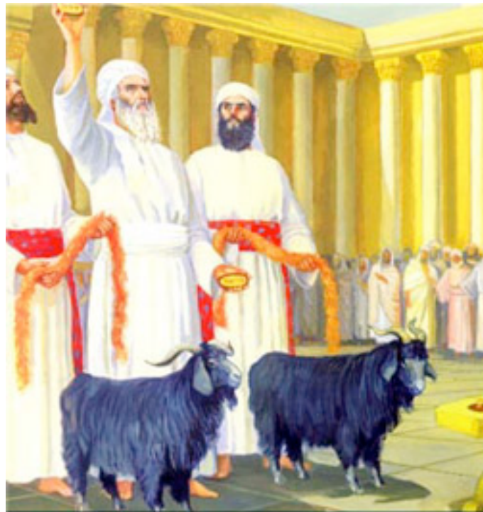
Kohen Gadol performing one of his duties on Yom Kippur

Timeline: The prophet Isaiah lived about 2500 years ago.