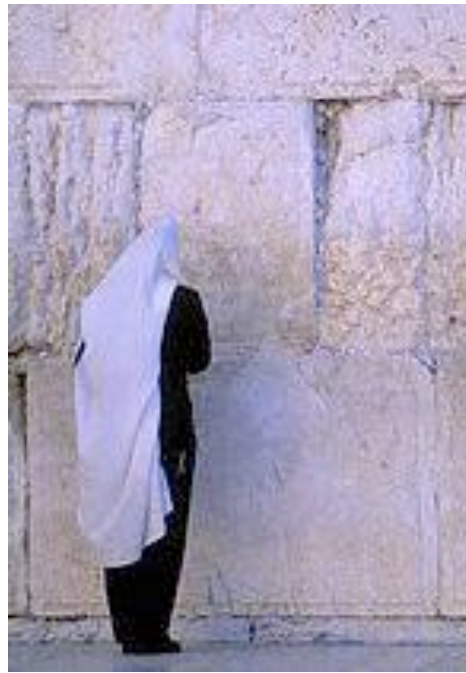
Prayer at the Western Wall