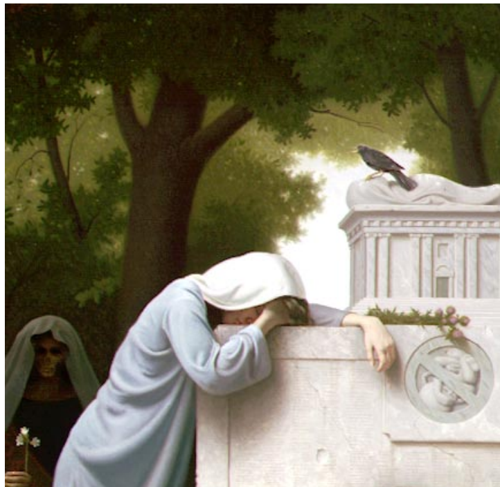
Rachel Crying for her sons

The connection to the Parasha: The Haftorah contains Hashem's promise to Yirmiyahu that there will be a Jewish Redemption. Since the redemption will come around the time of Rosh Hashanah, we therefore read this Haftorah