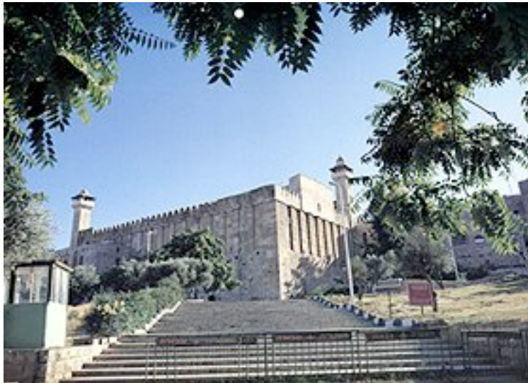
Ma'arat HaMachpelah in Chevron, Israel

by the Priests doing work in the Holy Temple). They were the custodians of the Ark of the Lord. He wore a wooden yolk around his neck. Yirmiyahu was known as the Weeping Prophet. Yirmiyahu wrote 3 Books: Yirmiyahu - 52 chapters, Eicha (Lamentations), and Melachim (The Book of Kings). The time span of the book 66 years. Baruch was his friend and disciple. He was stoned to death after fleeing to Alexandria, Egypt.