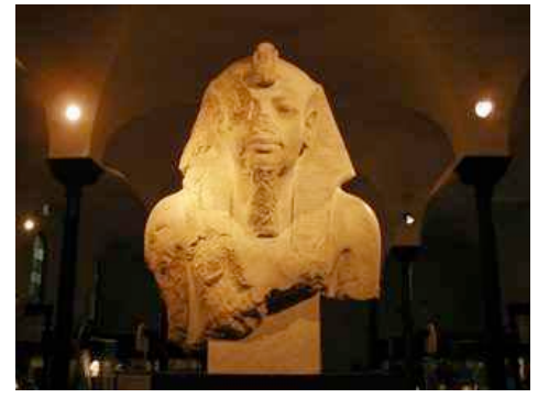
A statue of an Egyptian Pharaoh