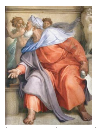
The prophet Ezekiel by: Michelangelo

The Haftorah is read from the book of Yechezkel (Ezekiel) 28:25-29:21