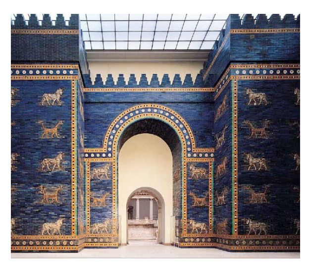
The Gates to Nebuchadnezzar's Palace

Famous Phrases: Yechezkel 36:26, "v'hasirosi et lev ha'even m'bsarchem v'natati lachem laiv basar" "And I shall remove the heart of stone from you and give you a heart of flesh".