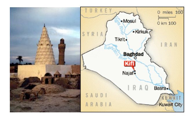
Ezekiel's the prophets Tomb is in Iraq

Famous Phrases: Yechezkel 36:26, "v'hasirosi et lev ha'even m'bsarchem v'natati lachem laiv basar" "And I shall remove the heart of stone from you and give you a heart of flesh".