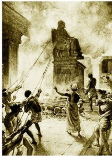
King Josiah cleaned out Jerusalem of its Idols

Background: King Yoshiyahu's two predecessors were both reshaim, evil people. His grandfather, King Menashe, set up an idol in the Bais Hamikdash and also erased the name of Hashem in the Torah, replacing it with the name baal (an idol). King Menashe's son, Amon, placed an idol in the Holiest of Holies. After two years of reign, Amon was assassinated by his ministers, and his eight year old son, Yoshiyahu, succeeded him. Yoshiyahu had all of the idols destroyed outside of Yerushalaim in the valley of Kidron. He then ordered the ashes to be moved to Bais Ail. Yoshiyahu also got rid of all the wizards, and priests.